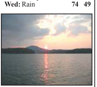
Upstream Elevation Predicted 04/20/11 Lake Chatuge

1923.06 1777.02 Lake Nottely 1655.96 Blue Ridge