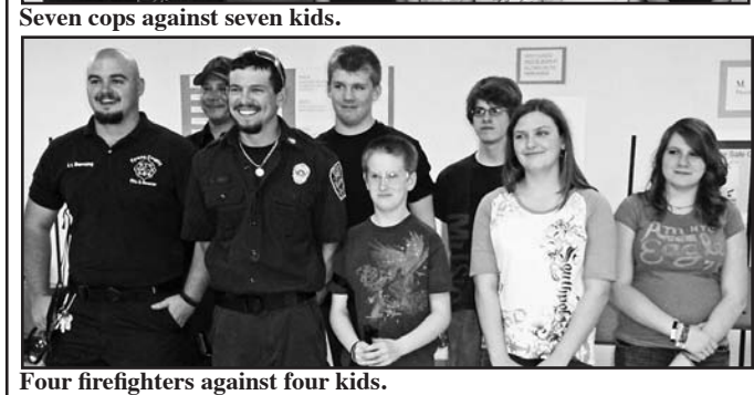
After training and com-

Braggin' Rites. The first shoulder-topeting among themselves for 15 weeks, the Towns County shoulder contest began after 4-H BB Gun kids once again, school, Wednesday, March 14, laid down the gauntlet and chalat the Georgia Extension Office. lenged the Towns County Fire Eight firefighters and four (one Department and the Sheriff of their best shooters was out Department to a 4-position rifle with the flu) 4-H markspersons began the contest. Forty shots match for the cherished 2012