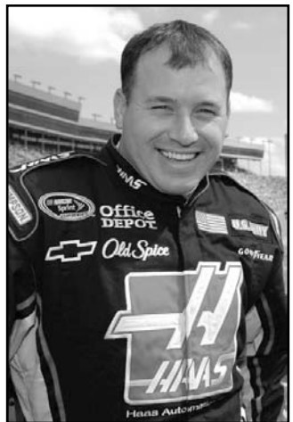
"Flyin'" Ryan Newman, Phoenix Cup winner