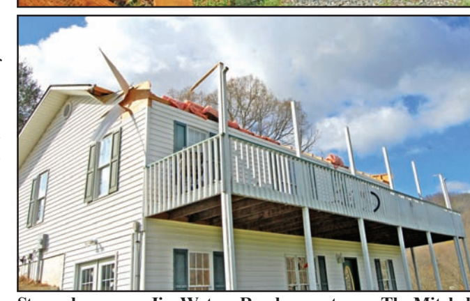
Storm damage on Jim Watson Road was extreme. The Mitchell Family home was damaged extensively.