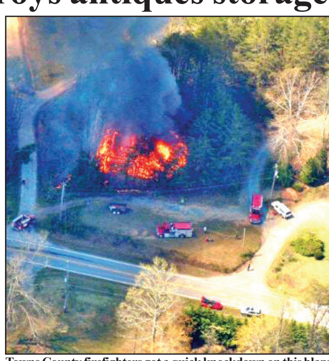
Towns County firefighters got a quick knockdown on this blaze last Thursday as a plume of thick black smoke filled the air on GA 288 in the Sunnyside Community.