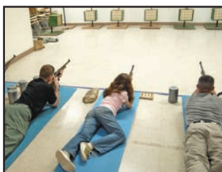
Local 4-Hers recently took on deputies in a marksmanship competition. Check out this week's sports to see who won: the girls or the boys?

The Towns County Recreation Department and United Community Bank in Hiwassee will be hosting its annual Easter Egg Hunt on Saturday, April 11 at 10:30 a.m. All boys and girls ages 3 through 9 are invited to come out. A special activity is planned for children 2 years and younger. The hunt will be held on the recreation ball fields located on Highway 76 just west of Hiwassee. For more information, call 706-896-2600 or 706-896-4186.