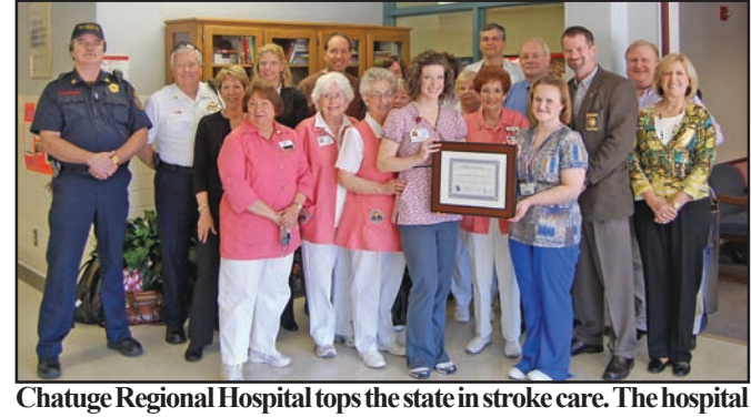
was honored last week as the best in the state.

The primary goal of the Coverdell Acute Stroke Reg-performer in the small hosistry program is to improve the pital category.