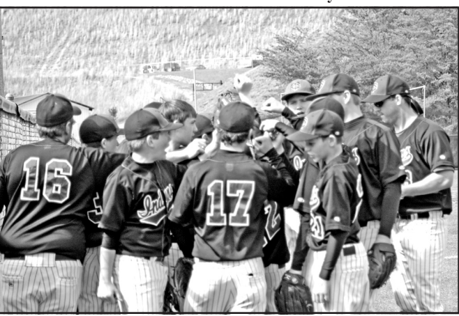
The Indians season came to a close on Saturday in Tiger.