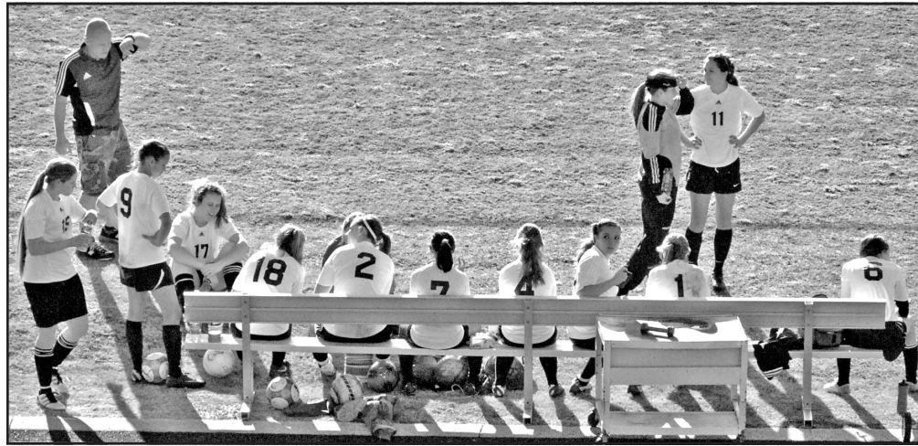
The Towns County Lady Indians ponder their fate during a halftime break against Athens Academy.