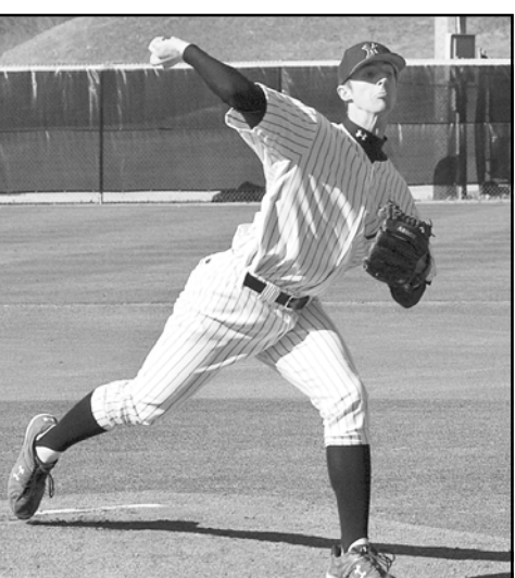
Highlanders in 9-6 win.