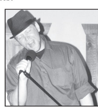
Compete for a recording con-

Contestants are encouraged to invite their family and friends to support them during the competition for North Georgia Idol. The public is welcomed