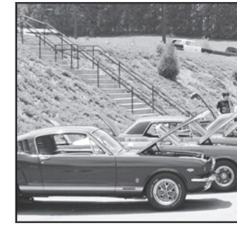
Enjoy the 2nd Annual Car &

is North Georgia's premier vacation destination and special events venue. A rustic mountain lodge surrounded by cabins nestled in a resort community offering Lodging, Casual Fine Dining,