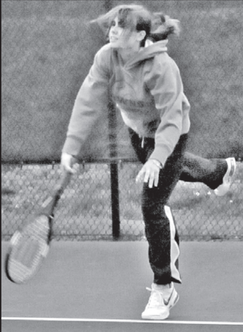
The Lady Indians dominated in singles and doubles action last week.

regular season. The Lady Indians lost that match up and the end result was a first round match up with Pace Academy, which defeated the Lady Indians and eliminated any hopes of a state tennis championship. The boys' team, which is much improved over a year ago, lost their opening round Region 8-A match up to miss the 2010 state playoffs. The 2011 version is showing great promise and the prospects of advancing from the region playoffs to the state playoffs appear more hopeful than in recent years.