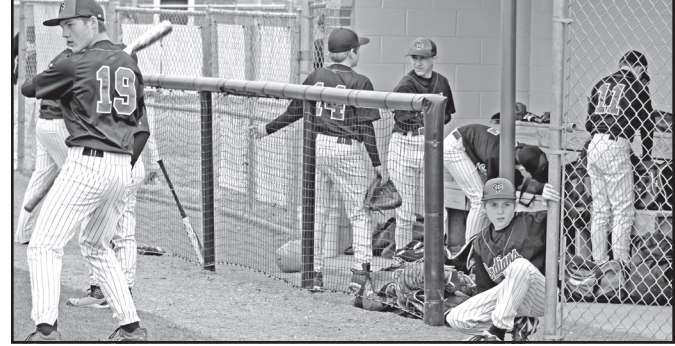
The Indians hate rainouts of any scheduled game.