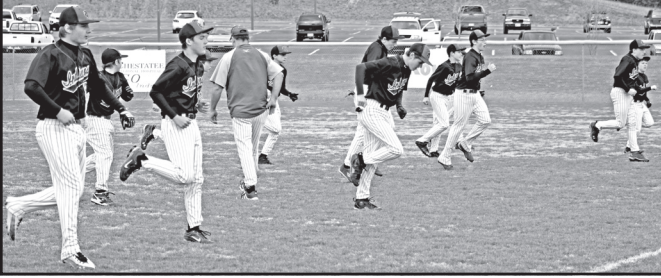
The Indians are off to their best start in years.