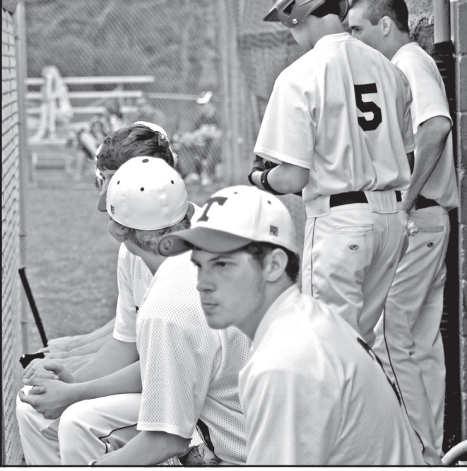
The Indians pray for a rally against Riverside.

By Charles Duncan Towns County Herald cduncan.tch@windstream.net