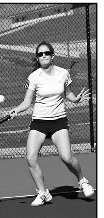
Playing in Hilton Head, SC, the YHC women dropped a close 5-4 match against Tiffin University.