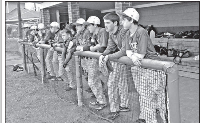
The Indians aren't happy about their performance against Region 8's top team George Walton.

The Hebron game is on Tuesday, the Lakeview game is on Thursday and the Indians face Riverside on Friday. All game times are at 5 p.m.