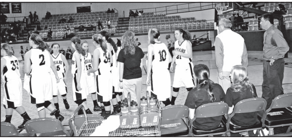
The Lady Indians look forward to the fall when they begin another quest in Region 8-A basketball.