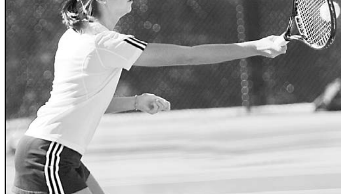
The Lady M'Lions fell 9-0 to the Carson-Newman Eagles Saturday at the TCHS courts.