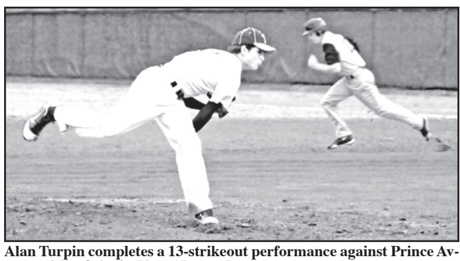
enue with a 3-1 win

uled to travel to Athens on Thursday as they take on Athens Academy. Game time: 5 p.m. On Saturday, the Indians will take on Tallulah Falls in a and the rest of the Indians' team double-header at Indian Field. Game time: 1 p.m.