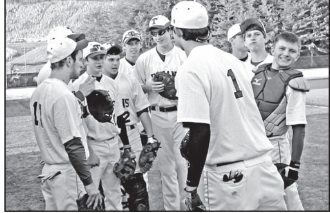
The Indians remain optimistic despite an 0-3 start to the season.