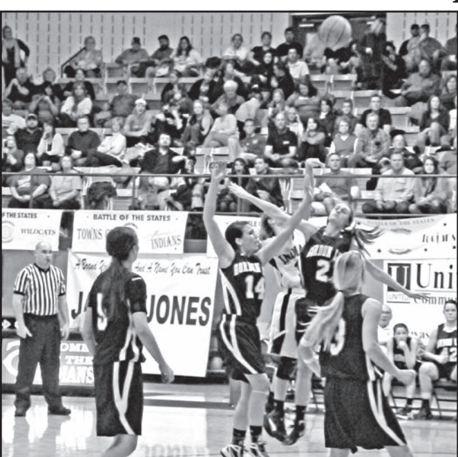
The Gordon Lee girls won the Battle of the States tournament but lost to Southwest Atlanta Christian in the state playoffs.