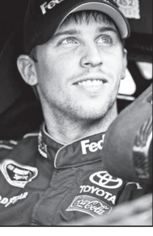
Denny Hamlin wins at Phoenix Furnished by Toyota

Top-10 leaders after 2 of 36: 1. Hamlin-89, 2. Biffle-83, Martin-71, 8. Logano-70, 9. 3. Harvick-81, 4. Kenseth-79, Busch-66, 10. Edwards-63.