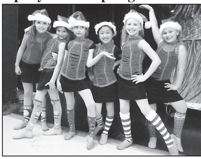
The BDA Young Performers Group