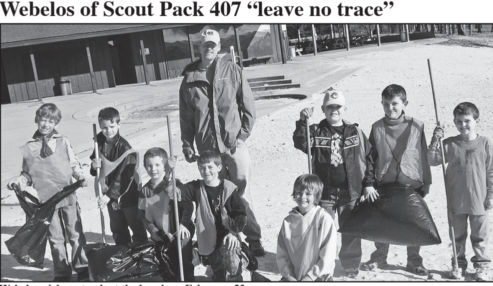
Webelos pick up trash at the beach on February 22.

Oest 266 Cleveland St., Blairsville 706-745-6343