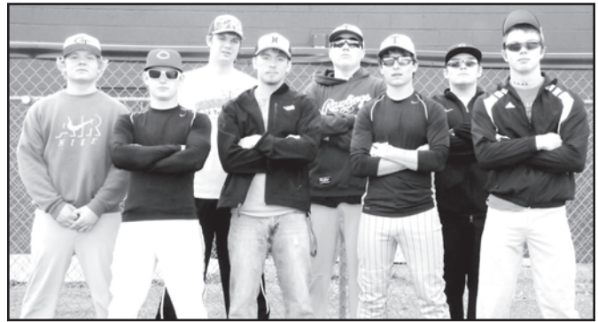
Eight seniors lead the Towns County Indians baseball attack as they prepare for the upcoming season

"We have 17 players listed on the roster but only 15 are healthy. All 17 are working as hard as they can. That's all you can ask for as a coach."