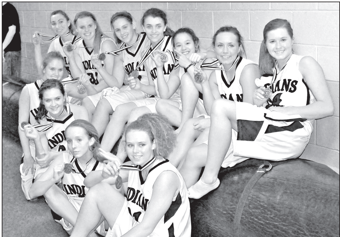
The championship medals go to the Lady Indians