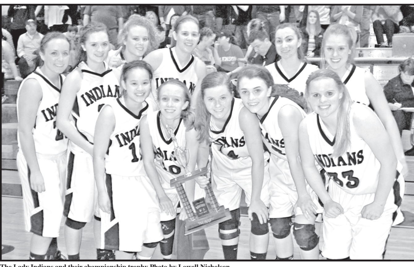
The Lady Indians and their championship trophy