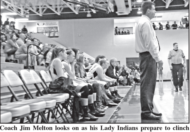
heir second consecutive Region 8-A title.

Last half scoring surge propels them to third title in four years