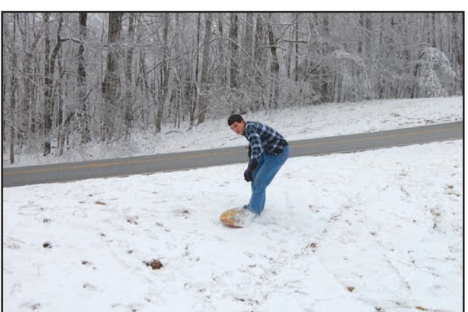
Weekend snowboarding on Jack's Gap proved much more eventful than watching the 2010 Winter Olympics in balmy Vancouver, BC, Canada. Temperatures are 46 degrees at the site of the 2010 Winter Games.