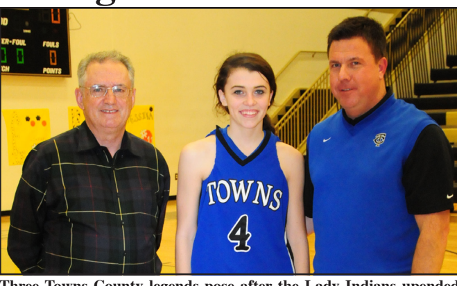
Three Towns County legends pose after the Lady Indians upended Commerce on Tuesday.

Lady Indians complete undefeated season in Region 8A with win at Commerce