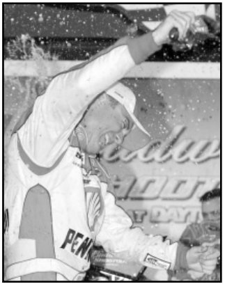
2010 Bud Shootout winner, Kevin Harvick