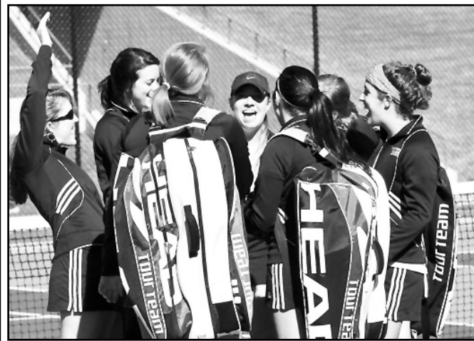
YHC women's tennis team huddle before the start of the matches on Florida road trip.

Young Harris College's women's tennis team returned to the court Sunday after having its match against St. Petersburg College rained out the day before, but the Mountain Lions fell 7-2 to host Florida State College-Jacksonville.