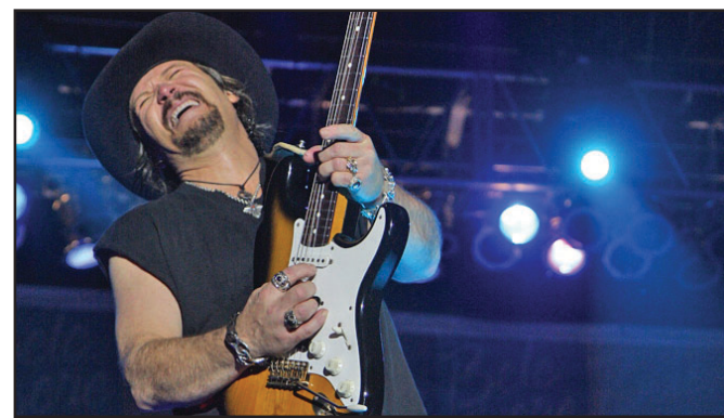
Country music legend Travis Tritt will play The Hall on April 16th.