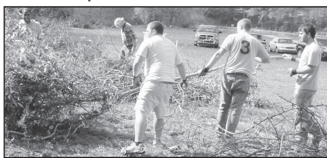
Now that large, nonnative and invasive, Chinese Privet plants have been removed from along Butternut Creek, native trees will be planted on Saturday, January 22nd.

Once again, we need your help! Come out for one hour, three hours, or any