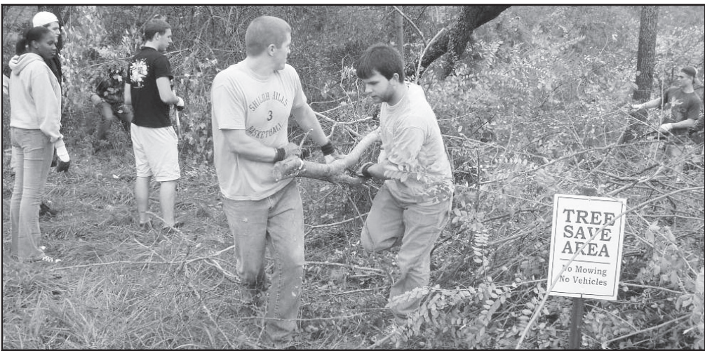
Young Harris College Conservation Biology students came out on October 20, 2010 to help remove invasive plants along Butternut Creek at the Union County Farmers Market.