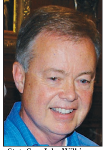
State Sen. John Wilkinson

expectations and I look forward to continuing to repre-State Capitol exceeded my sent the voice of my con-