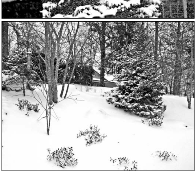
Scenes from around Towns County show this snow packed a wallop as it spread throughout the county. Many families became shut-