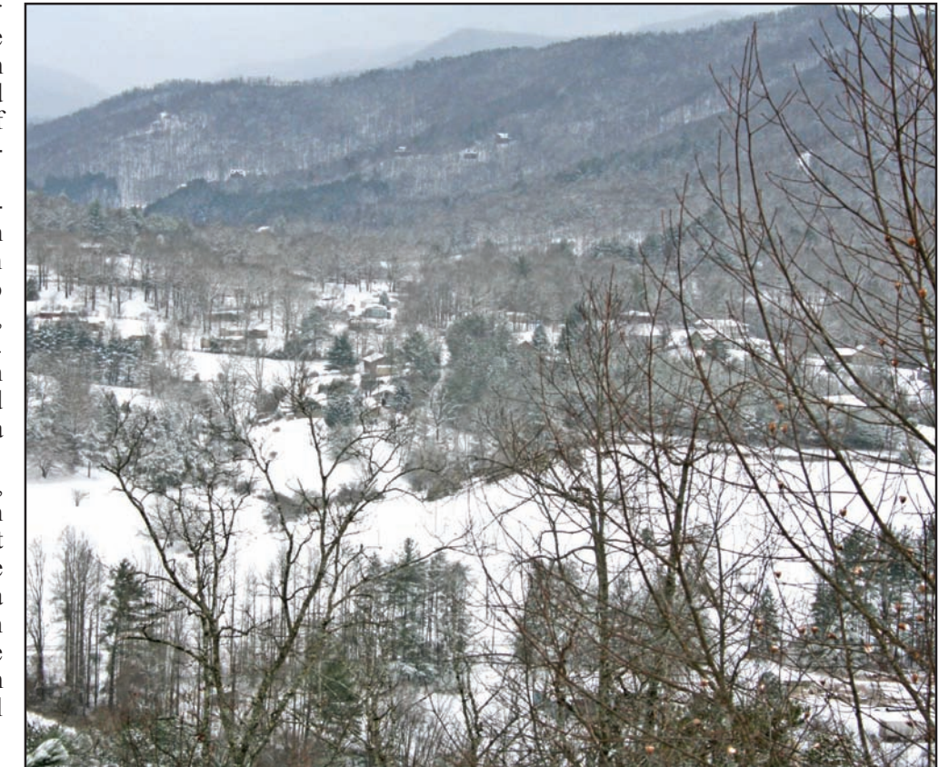
Old Man Winter paid more than just a visit; it appears he's moved into Unicoi Gap. A winter storm moved into Northeast Georgia at midnight early Monday and stuck around.