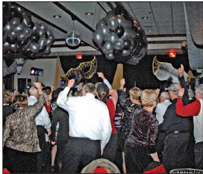
Brasstown Valley Resort was the place to be in Towns County on New Year's Eve. The New Year was welcomed.