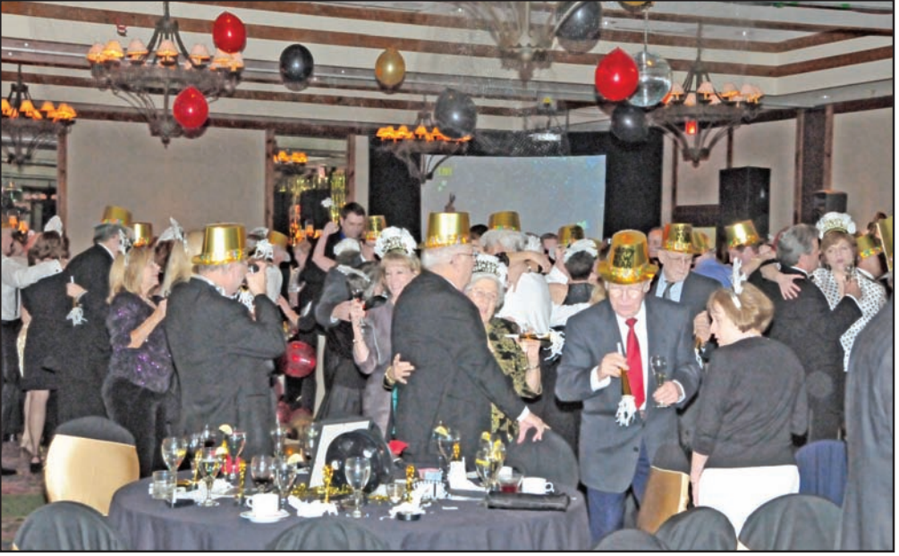
Party goers welcome in the New Year at Brasstown Valley Resort in Young Harris.